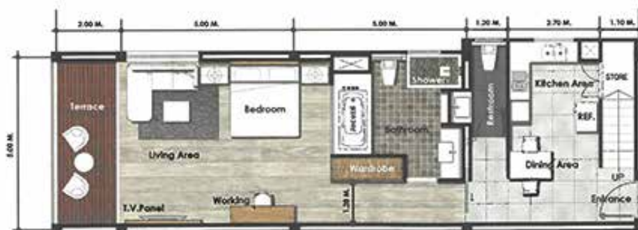
TYPE C: LOWER FLOOR DUPLEX