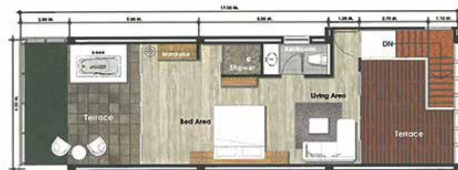
TYPE C: UPPER FLOOR DUPLEX